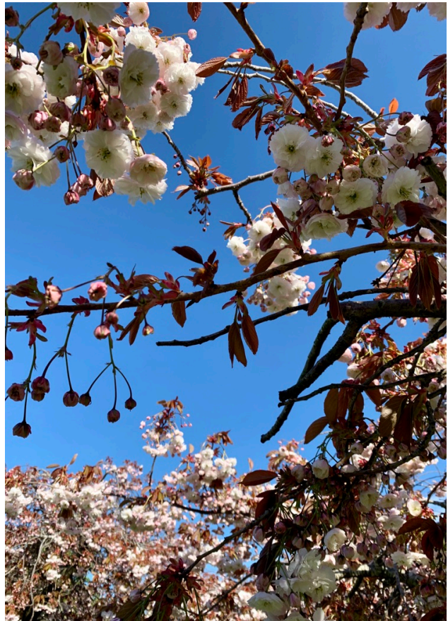
Signs of Spring in UCD

Looking to the future we wait in hope and expectation, there will be an end to this pandemic and in the meantime, there will be steps taken to allow normal life to return. I imagine that gatherings in churches are unlikely to be the first thing permitted. Even a return to allowing 100 people to gather with social distancing would be something. It would be very nice to be able to reopen the church and allow parishioners out for a walk to drop in and offer a prayer. I have scattered thoughts now and again about things we might be able to do, like have a Mass in the carpark, with the people staying in their vehicles and an altar at the Millennium Garden.