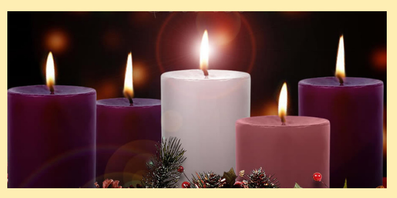
At Christmas we also light the white candle, representing the presence of Christ among us, and place it in the center.