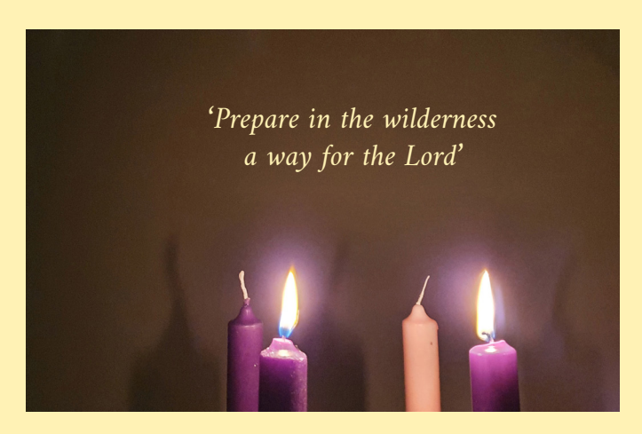
2nd Sunday of Advent, December 5th/6th, the 1st and 2nd purple candles are lit.

Scripture Readings, 2nd Sunday of Advent, Year B: