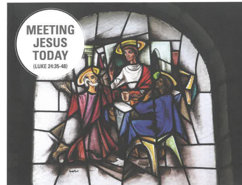
Stained glass window in the 15th-century Elzenveld Chapel in Antwerp, Belgium, depicting Jesus and two disciples at Emmaus

Our gospel passage follows the encounter of the two disciples with the risen Jesus on the way to Emmaus and his making himself known to them in a setting with a Eucharistic background.